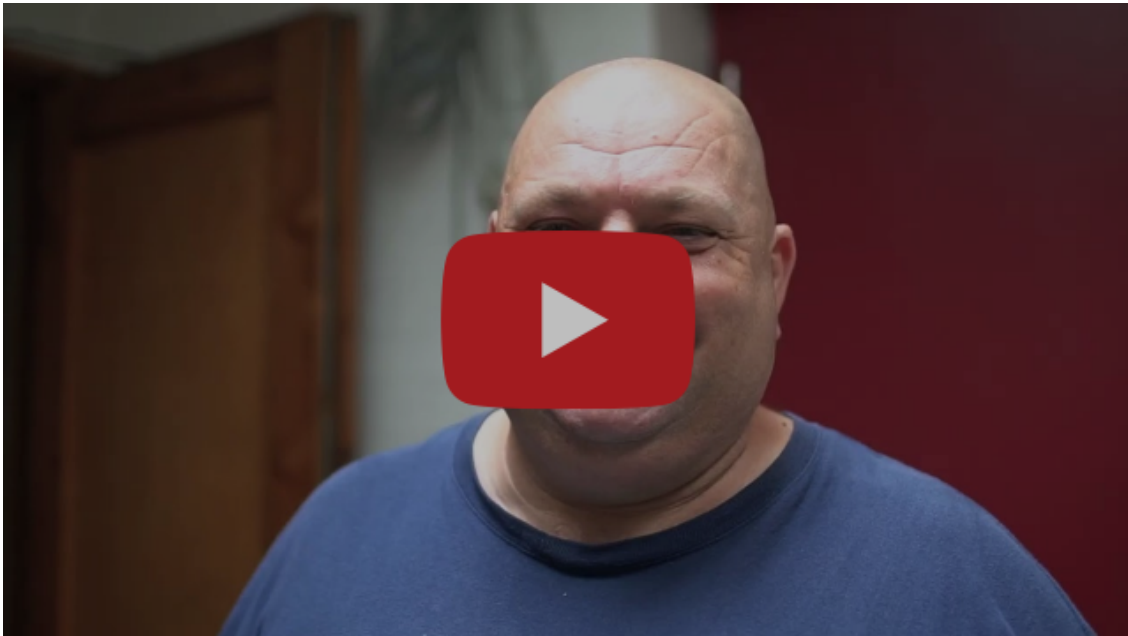
Warm Welcome Campaign