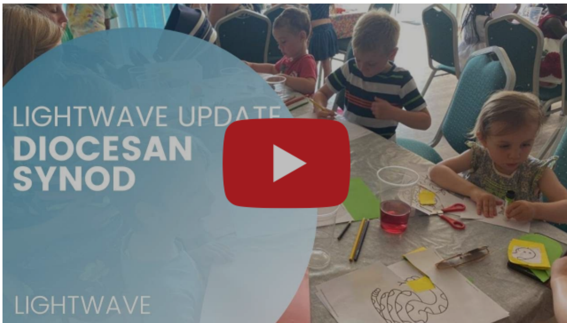
Lightwave Update at Synod